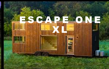
ESCAPE ONE XL